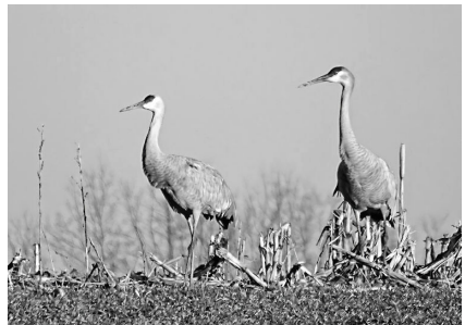
Su Snyder met these Sandhill Cranes on 02 Feb along Valley Road at Killbuck.

There were only two records, each of single birds, from Dec. Aaron Ambos flushed one at