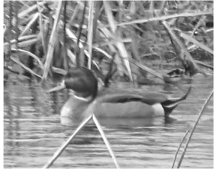
Su Snyder looked close at this unusual hybrid Mallard x Northern Pintail along Valley Road at Killbuck on 08 Feb.

Sue Evanoff and Su Snyder photographed a hybrid at Killbuck on 08 Feb.