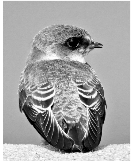
This cute juvenile Bank Swallow at Fairport Harbor, Lake, on 18 Jul.