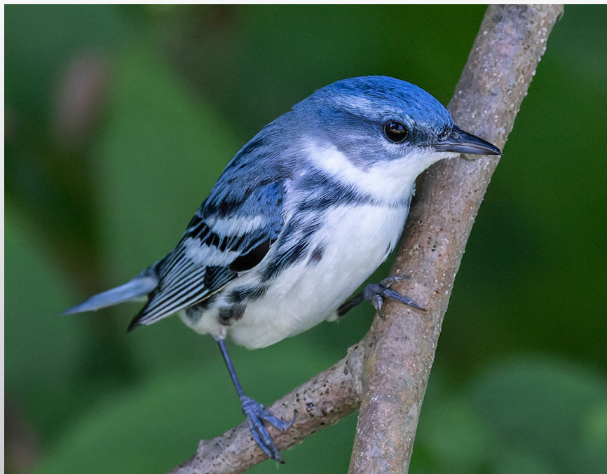
This bright Cerulean Warbler surprised Dana Campbell when it popped out of the woods near him at Spencer Lake WA, Medina, on 17 Jun