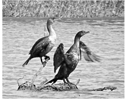
Double-crested Cormorants are regularly seen along Wilderness Road where Su Snyder photographed these on 11 Jun.

Cuyahoga , Erie , and Summit each provided counts of 300. (66 counties)