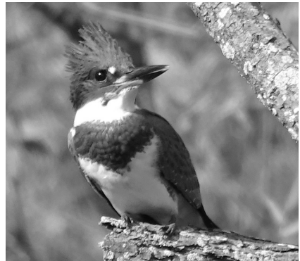
This Belted Kingfisher was photographed by Su Snyder along Wilderness Road on 25 Jul.

Tracy Engle counted 11 along the upper Cuyahoga River from Eldon Russell Park, Geauga , on 04 Jun. (79 counties)