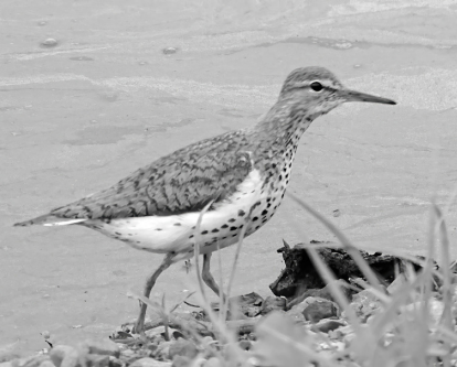
Several Spotted Sandpipers were regular visitors along Wilderness Road where Su Snyder photographed this one on 25 Jul.

A trio of birders counted 24 at Cleveland Harbor on 24 Jul. (67 counties)