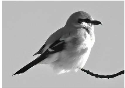
Kisa Weeman captured a sharp image on 26 Jan of the Northern Shrike that stayed a while at the Bath NP, Summit .

All of the sightings were of single birds. See the map for the 27 counties with sightings.