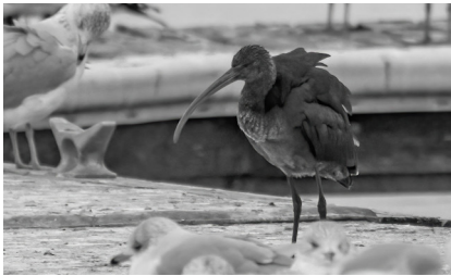
The Glossy/White-faced Ibis was photographed by Ed Wransky at the docks in Lorain (city) on 05 Dec.

An indeterminate bird spent from 30 Nov to 10 Dec at Lorain (m. obs.).