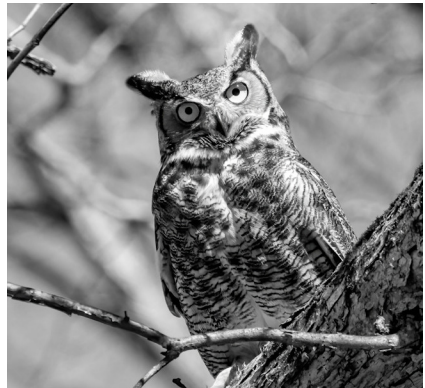
Ed Wransky got a clear shot of this Great Horned Owl in La-Grange Township, Lorain , on 27 Feb.

There were eight reports of three birds. (62 counties)