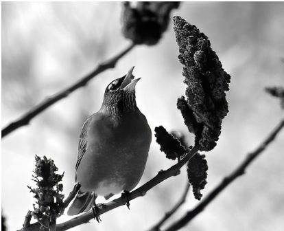
This snacking American Robin was on 29 Jan at PPG Lime Lakes, Summit.