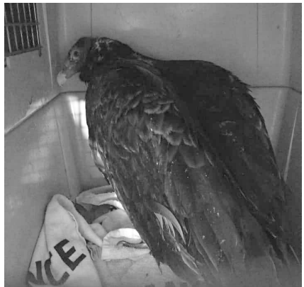
Figure 3 — A Turkey Vulture warms up and dries off overnight in a plastic animal carrier. The bird was unable to fly when Tim Jasinski approached it, due to the ice build-up on its back.

he keeps in his car for wildlife rescues, and then transferred to the top of Jasinski's basement steps where it was warmed by the heat of the home in order for the ice to thaw overnight (Figure 3).