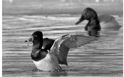
A fast shutter helped Tom Fishburn get the action shot of this Ring-necked Duck on 21 Feb at Coe Lake, Cuyahoga .

Seneca Lake, Noble , hosted about 900 on 26 Feb (m. obs.). (69 counties)