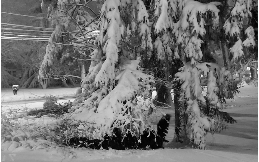
Figure 2 — Vultures, representing both species, huddled together under a nearby Norway Spruce.

of both species) were also on the ground, and were huddled beneath a sagging tree limb (Figure 2). It appeared that the vultures had fallen to the ground when the limbs collapsed; this may have been a limb that they were roosting on that dropped, but it also may have been a nearby limb that collided with their roosting limb, or simply scared them into flight when the limb broke.