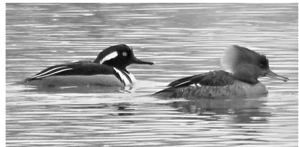
A walk through Killbuck let Su Snyder document a pair of Hooded Mergansers on 26 Feb.

Gautam Apte and Cassidy Ficker tallied 580 at Hoover Reservoir on 23 Feb. Tyler Ficker’s 300 at East Fork on 08 Feb were the most elsewhere. (74 counties)