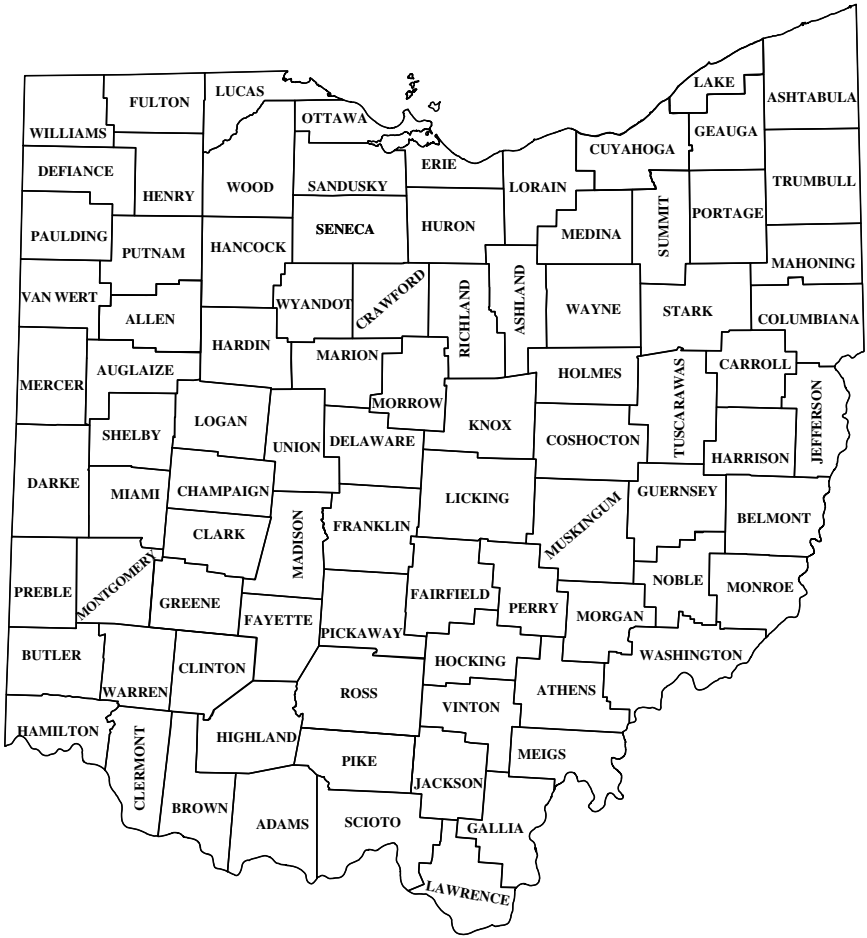
The Counties of Ohio