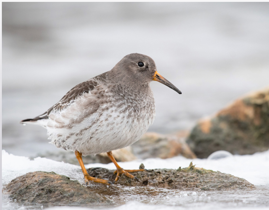
Ethan Rising made a quick trip to East Fork on 13 Feb to spend time with a Purple Sandpiper.