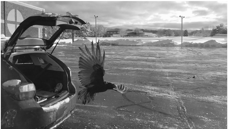
Figure 4 — An ice-free Turkey Vulture emerges from the back of Jen Brumfield's car. Her car's smell is forever altered.

Communal roosting is well documented in Turkey and Black vultures, and both species often roost together (Buckley 2020, Kirk and Mossman 2020). Their roosts are located in trees, and both