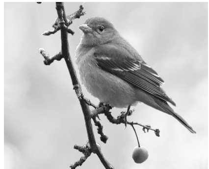
Lakewood Park Cemetery, Cuyahoga , held a rare western visitor, this Western Tanager that Gautam Apte saw feeding on 01 Dec.

An apparent female spent 05 to 13 Dec at Lakewood Park Cemetery, Cuyahoga ; lots of posts had photos. The OBRC has a report from Summit .