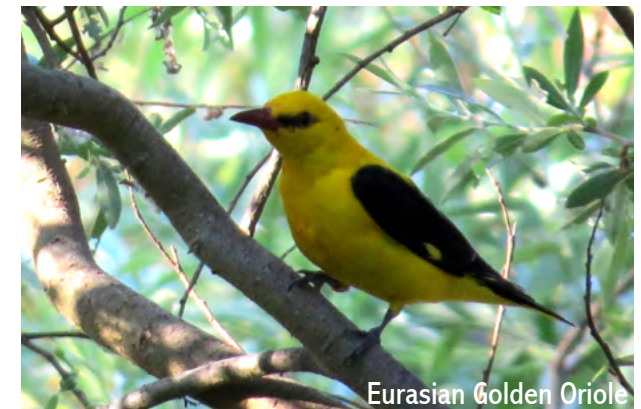
Eurasian Golden Oriole