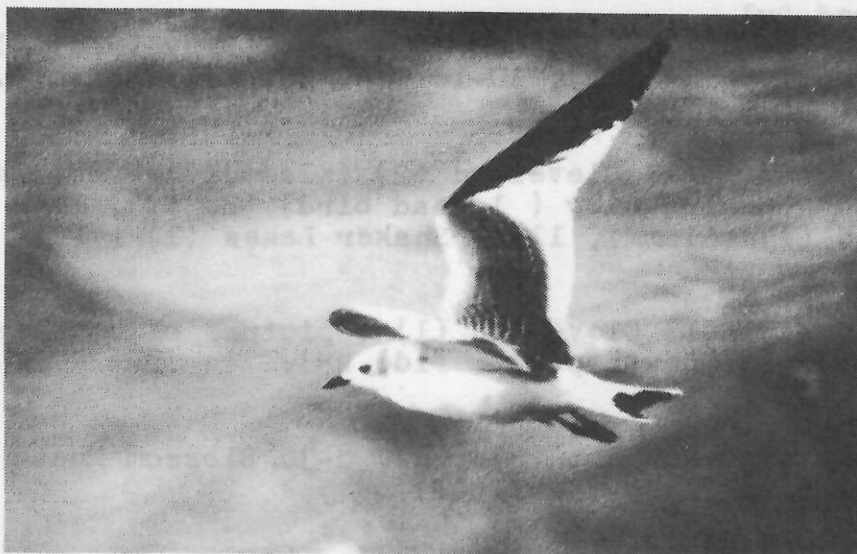
Sabine's Gull. October 1978, Cleveland, Ohio.

Peak 396 on 8-29 Cleveland (Klamm), 200 on 10-1 White City (Hoff.); Late 11-27 Cleveland (Klamm), 11-5 Erie Co. (JP), 10-28 Franklin Co. (JC).