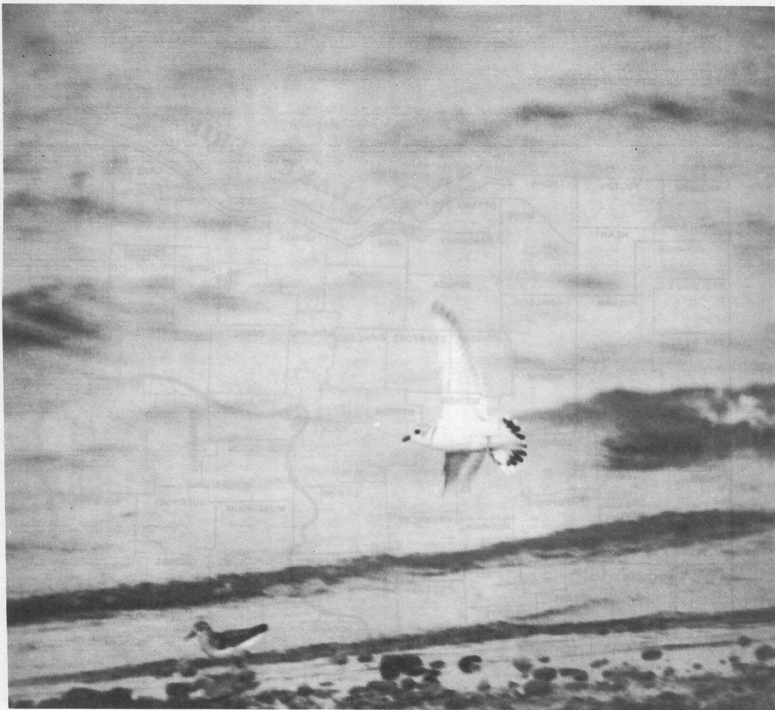
Piping Plover. 25 August 1978, Alum Creek Reservoir (Delaware County), Ohio.