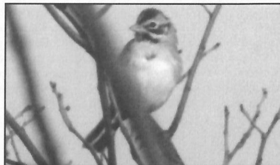
This lark sparrow was found on the Ragersville, Holmes Co., CBC on 30 December 1997 and remained into the Spring 1998 season.