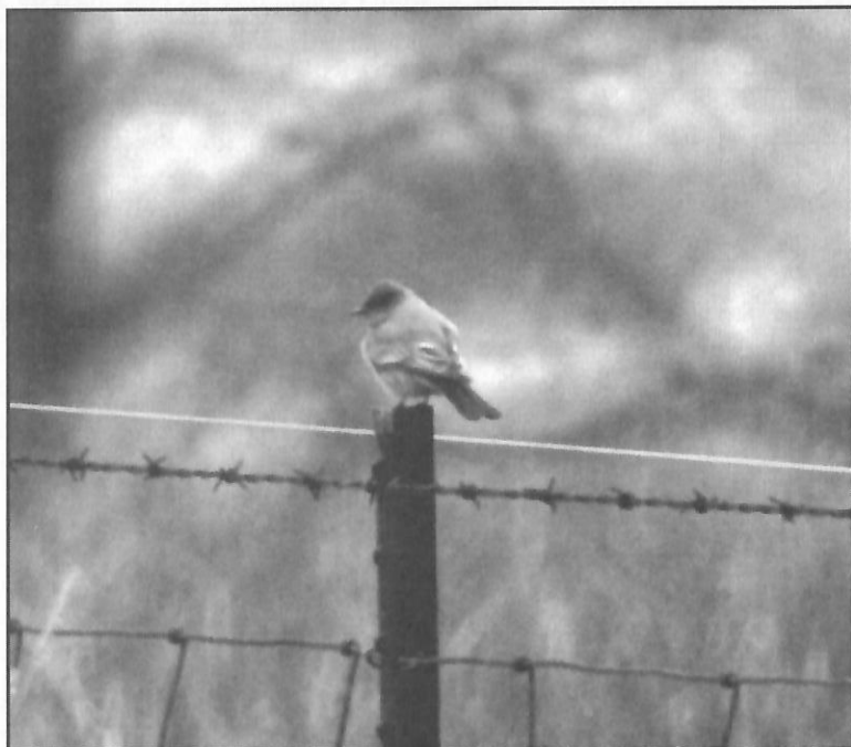
A January century list seems a lot more obtainable when rarities like this Say's phoebe appear. This bird was found in Knox Co. on 11 December 1997 and remained for the listers until 7 January 1998.