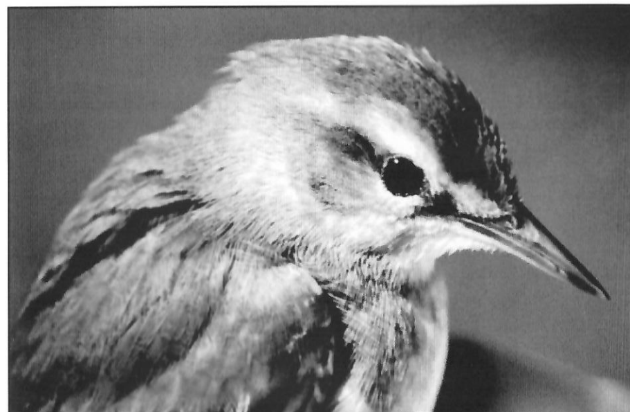
This Swainson's warbler managed to find itself in one of the Black Swamp Bird Observatory's nets at Navarre Marsh, Ottawa Co. It was banded on 28 April 1998 and was relocated two days later. Photo by Bruce Simpson on 28 April 1998.