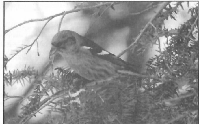
White-winged crossbills were widely viewed during the Winter 1997-98 season. This male was photographed in Toledo, Lucas Co., in January 1998.