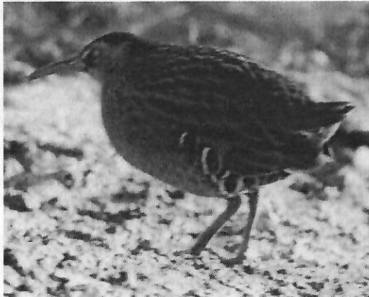
Virginia Rail : South Bass I., Ottawa Co. 24 Nov., 1997