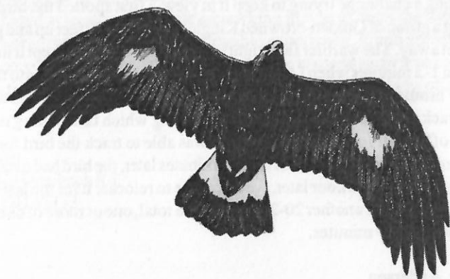
Golden Eagle : Original 1999 Artwork by Jenny Brumfield

To add this species to your state list, bundle up in your warmest clothes, and choose a spot with a good view of the northern sky; try the corner of Girdham and Reed Rds. in the Oak Openings or areas near Toledo Express Airport.