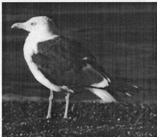
Lesser Black-backed Gull : Sep. 1997 East Fork S.P., Clermont Co. [ph. H.A.]

Selected Reports : 5-26 Sep., 1 ad. @ East Fork S.P., Clermont Co. [H.A. (ph.) / L.G. / m.obs.]; 20 Oct., 1 ad. @ Old Woman Creek S.N.P., Erie Co. [V.F.]; 25 Oct., 2 @ Huron Harbor, Erie Co. [J.Hm. et al.]; 1 Nov., 1 @ Avon Lake P.P., Lorain Co. [R.Ro.]; 15 Nov., 2 ad. @ Eastlake P.P., Lake Co. [E.S.]; 15 Nov., 1 @ Vermilion, Erie Co. [J.Bu.]; 16 Nov., 1 ad. @ Ottawa N.W.R., Ottawa/Lucas Co. [B.B.]; 19 Nov., 1 2nd yr. @ Edgewater Park, Cuyahoga Co. [DJHo]; 21 Nov., 4 (3 ad., 1 1st yr.) @ Eastlake P.P., Lake Co. [K.Me.]; 23 Nov., 1 @ Oberlin Res., Lorain Co. [R.H., S.Wg.]