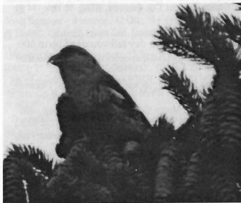
White-winged Crossbill : 2 Nov., 1997 South Bass I., Ottawa Co. ph.S.Wu.

Indigo Bunting Departure : 25 Oct., 1 @ Paulding Co. [DMD]; 18 Oct., 2 @ Springville Marsh