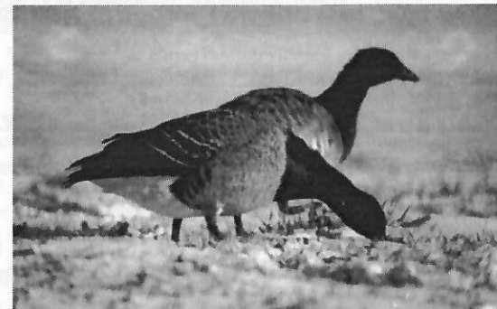
Brant : Maumee Bay S.P., Lucas Co. 13 Nov., 1997