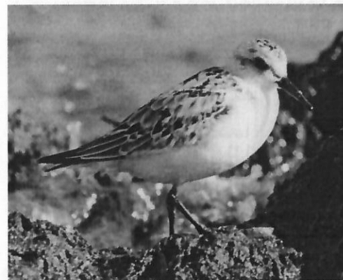
Sanderling : South Bass I., Ottawa Co., 18 Nov. 1996