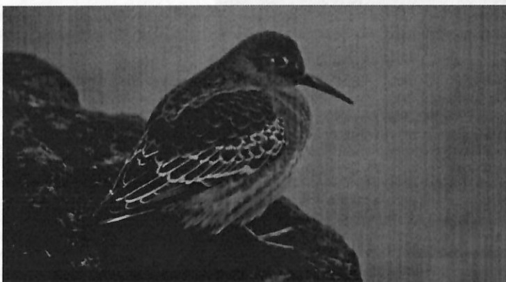
Purple Sandpiper : Huron pier, Erie Co., 28 Oct., 1997 [ph. V.F.]; one of very few October records

Departure inland : 29 Nov., 2 @ Fostoria Res. #1, Hancock Co. [K.N. & S.R.]; 19 Nov., 4 @ Cowan L., Clinton Co. [L.G.]