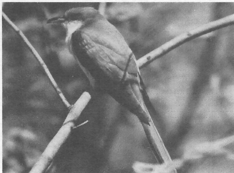
Yellow-billed Cuckoo. S. Bass Is. (Ottawa Co.), May 20, 1996