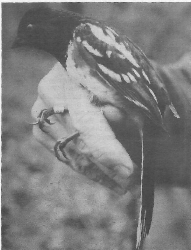
Spotted Towhee. Springville Marsh SNP (Seneca Co.), May 4, 1996.

[Editor's note: The above observation represents a new species for Ohio, being the first record accepted by the Ohio Bird Records Committee. This article first appeared in The Cleveland Bird Calendar 92(4):48-49.]