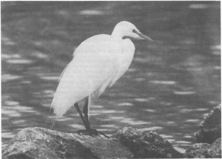
Great Egret. S. Bass Is. (Ottawa Co.), April 18, 1996

Once again, the Black Swamp Bird Observatory operated a bird banding site at the Navarre Unit of Ottawa National Wildlife Refuge (Ottawa Co.), behind the Davis-Besse Nuclear Power Station. This site was manned every day, weather permitting, from mid-April to early June. Strong movements were noted April 25, May 3, May 8-10 (a single-day capture record occurred May 10 with 1260 individuals banded), May 18-23, and May 31-June 1. A total of 9255 individuals representing 105 species were banded at Navarre. The top 10 species banded were as follows: Magnolia Warbler-- 942; Common Yellowthroat-- 518; Am. Redstart-- 517; Swainson's Thrush-- 476; White-throated Sparrow-- 423; Yellow Warbler-- 420; Yellow-rumped (Myrtle) Warbler-- 379; Gray Catbird-- 318; "Traill's" Flycatcher-- 302; & Red-eyed Vireo-- 278. This data was reported in Dendroica 4(1):12, a publication of the Black Swamp Bird Observatory. BSBO, P.O. Box 228, Oak Harbor, OH 43449.