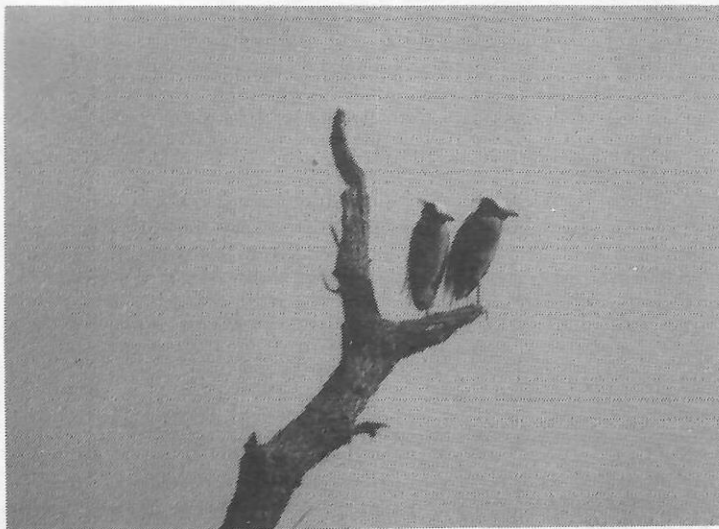
Yellow-crowned Night-Herons. Streetsboro Bog (Portage Co.), April 30, 1996.