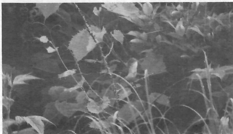
Bell's Vireo. Claridon Prairie (Marion Co.), June 25, 1995.