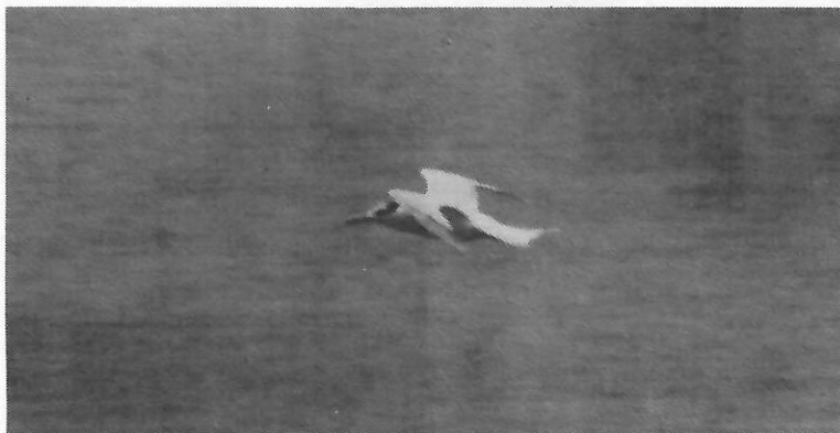
Royal Tern. Lorain (Lorain Co.), July 21, 1995.