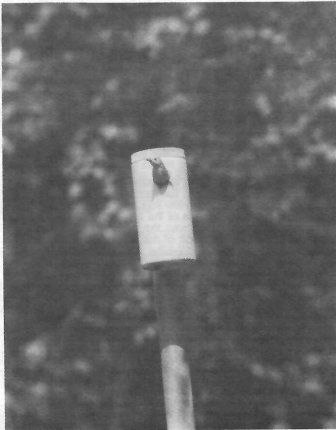
Prothonotary Warbler at artificial nesting structure along the upper Cuyahoga River (Geauga Co.).