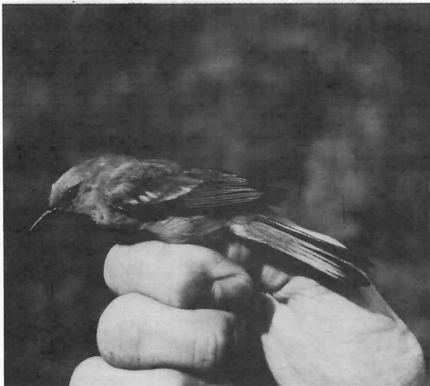
Blue-winged Warbler. Oak Hill, CVNRA (Summit Co.), June 14, 1995.