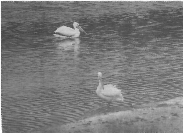
Am. White Pelicans. Willoughby (Lake Co.), June 9, 1995.

Blue-winged Teal -- A nest was found at MWF 7/23 (PW). Potential nesters include: 41 Magee 6/18 (HSH); 23