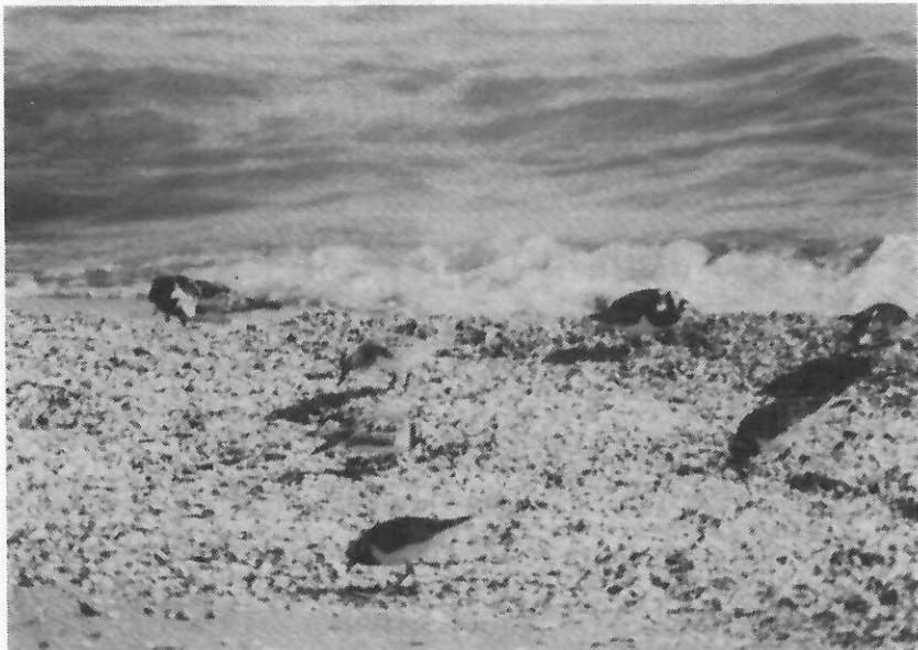
Ruddy Turnstones and Sanderling, Crane Creek SP (Lucas Co.), 5/20/95.

I arrived back at Killdeer with my wife at about 8:45 a.m. The stilt was still where I left it, and we watched it for some time. Then I scanned the mudflat for other birds, and found a few Black-bellied Plovers. But when I looked back for the stilt, it was gone. Knowing that the willows lining the pond prevented the entire area from being viewed from one location, I drove to the next small parking lot to the west. There I found the stilt again, this time at a distance of only 200 feet. We watched the bird until about 9:40 a.m., when it took flight and headed east and then south. It was apparently never seen again. By John Herman, 1217 Teddy Avenue, Bucyrus, OH 44820