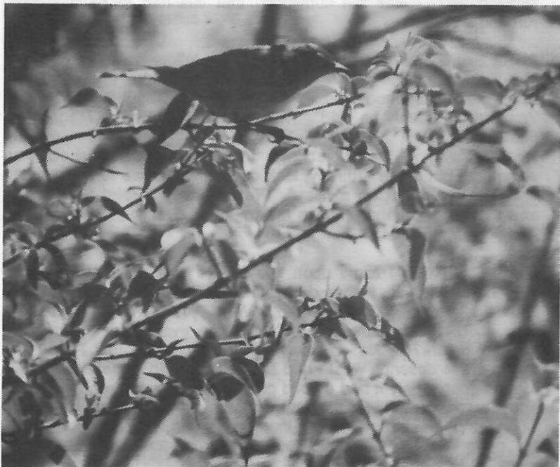
Kirtland's Warbler. Magee Marsh WA, May 21, 1995.