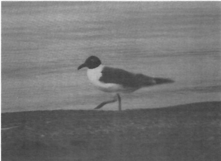
Laughing Gull. Alum Creek SP (Delaware Co.), 5/30/95.

For a total of 151 hours (1951 net hours) on 31 days between March 14 and June 6, 1995, I banded birds at Lakeshore Metropark (Lake Co.). My final tally was 3102 individuals banded, representing 103 species. Peak movements per month came on March 31 (101 indiv. banded), April 11 (177 indiv. banded), and May 10 (221 indiv. banded). My top numbers banded were: White-throated Sparrow-- 393; House Finch-- 359; Song Sparrow-- 324; Am. Goldfinch-- 288; Dark-eyed Junco-- 285; White-crowned Sparrow-- 118; Blue Jay-- 107; Gray Catbird-- 105; Chipping Sparrow-- 59; & Swamp Sparrow-- 57. Data by John Pogacnik, 4765 Lockwood Road, Perry, OH 44081.