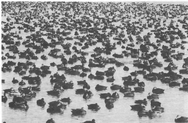
Am. Black Ducks. Castalia Pond (Erie Co.), Winter 1994-95.

Should one purchase this book? My answer would be yes, primarily by virtue of much new and valuable information, particularly in the Dayton area. A final thought-- Birding in Ohio is available at many major book stores throughout the state. Purchase of Birding in Ohio will help book store owners (and publishers) to see that the general public is indeed interested in Ohio birding books, and this factor may open the door for even more Ohio birding literature in the future. With more birding books on book store shelves, chances increase that patrons with a casual interest will take note, and possibly develop a serious, long-lasting interest in our avocation of choice. Acknowledgements: I would like to thank all those who offered advice during the preparation of this review, including Dan Best, Vic Fazio, Adam Goloda, John Herman, Tom Kemp, Ed Pierce, John Pogacnik, Ed Schlabach, Gildo Tori and especially those who contributed the regional accounts included above.