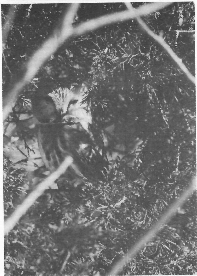
N. Saw-whet Owl. Englewood Reserve (Montgomery Co.), 1/29/95.