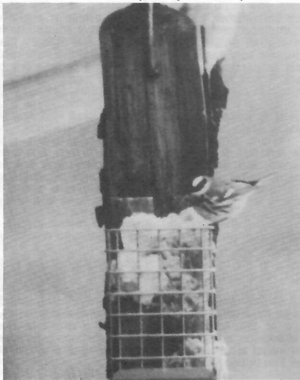
Black-throated Gray Warbler. Independence (Cuyahoga Co.), 12/18/93

"The Reports" section is intended to be read in phylogenetic order. The specific county location of most sites is listed in the accounts the first time a site receives mention. County names are often abbreviated by using their first four letters-- "Asht" representing Ashtabula Co., for example. Other place name abbreviations found in this issue are: BuCr (Buck Creek State Park/C.J. Brown Reservoir, Clark Co.); CPNWRC (Cedar Point National Wildlife Refuge Count, Lucas Co., compiled by Joe Komorowski); FRes (Findlay Reservoirs, Hancock Co.); HBSP (Headlands Beach SP and vicinity, Lake Co.); Lksh (Lakeshore Metropark, Lake Co.); OkOp (Oak Openings MP and vicinity, mostly Lucas Co.); ONWR (Ottawa NWR, Ottawa/Lucas Cos.); & ONWRC (Ottawa NWR Count, Ottawa/Lucas Cos., compiled by Ed Pierce).