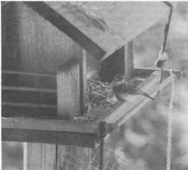
Yellow-fronted Canary. Elmore (Ottawa Co.), 12/28/93.