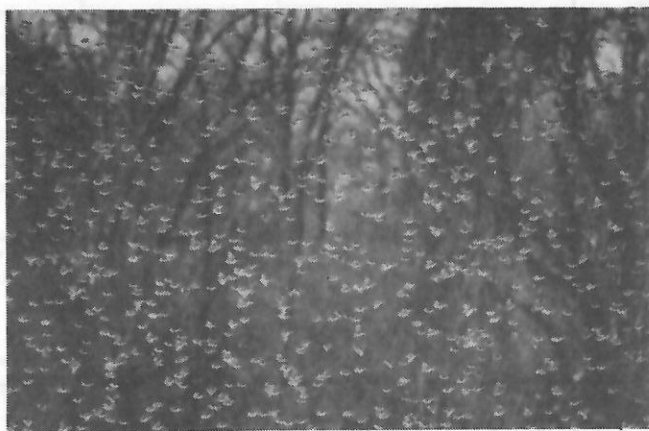
Common Redpoll flock. North Perry (Lake Co.), 1/18/94.