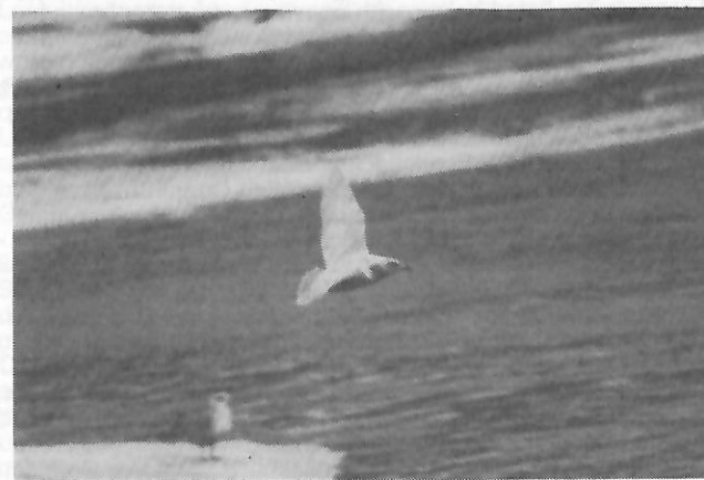
Iceland Gull. Independence Dam SP (Defiance Co.), 1/23/94.