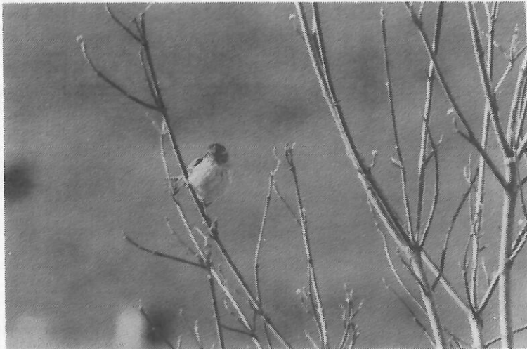
Palm Warbler. Holmes Co. Feb. 2, 1993.