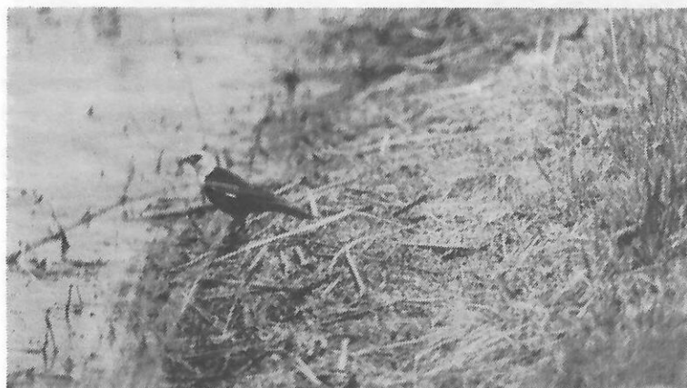
Yellow-headed Blackbird. Mallard Club Marsh WA. May 17, 1993.

[Editor's note: The above record is currently under review by the Ohio Bird Records Committee.]