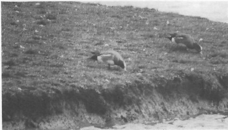
Eurasian and American Wigeon. Hoover Reservoir. April 11, 1993. [Currently under review by the Ohio Bird Records Committee.]