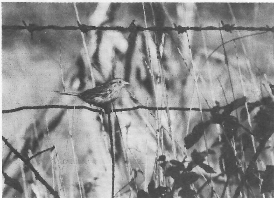
LeConte's Sparrow. Holmes Co., October 20, 1991