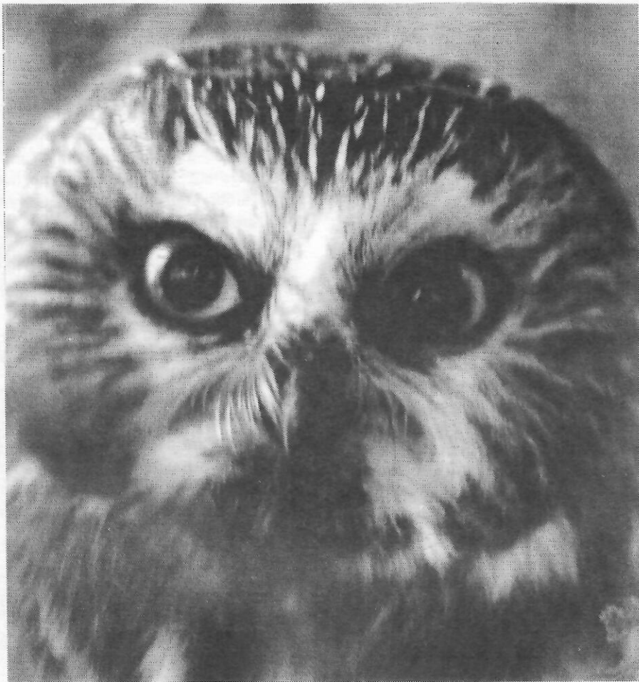
Northern Saw-whet Owl, Killdeer Plains Wildlife Area.