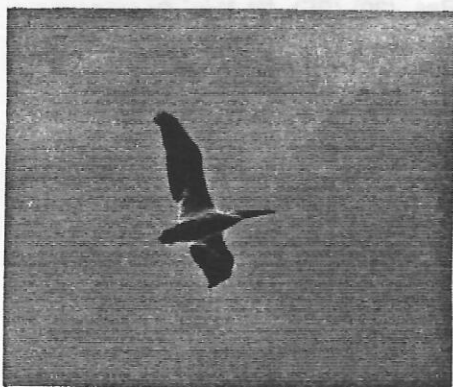
Am. White Pelican at ONWR, 5 August 1990.

RED-THROATED LOON : 22 Sep. Headlands Beach SP (LR, RHa), 10-17 Nov. Newtown (Hamilton Co.) (DHo, m.ob.). COMMON LOON : 26 Aug. Buck Creek SP (DO), 18-26 Nov. Caesar Creek (max 75) (m.ob.). PIED-BILLED GREBE : 12 Aug. CPNWRC (10), 1 Sep. Medusa Marsh (27) (BS), 20 Oct. Medusa Marsh (17) (BS), 4 Nov. ONWR (75) (TB). HORNED GREBE : 9 Oct. Findlay Res. (BH), 12 Nov. Caesar Creek (10) (WM). RED-NECKED GREBE : 23 Oct. Ferguson Res. (RC), 17-18 Nov. Caesar Creek (LG, TLi). EARED GREBE : 20 Oct.-18 Nov. Buck Creek SP (1-3) (DO, m.ob.), 25-30 Nov. Headlands Beach SP (CBC). AM. WHITE PELICAN : 5 Aug. ONWR (CA, RH, ph.), 27 Aug.-2 Sep. GLSM (SP, DG, JL).