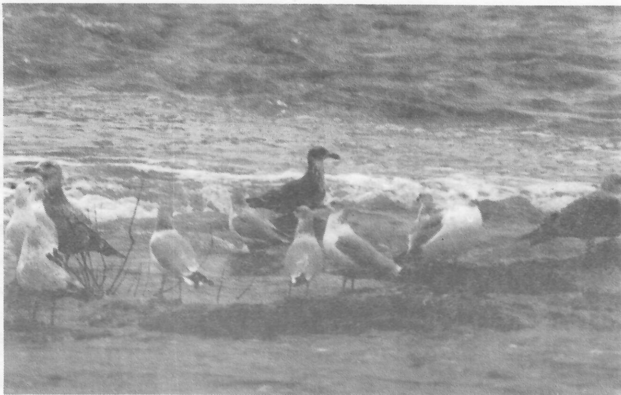
Second year Lesser Black-backed gull with Herring and Ring-billed gulls, Maumee River Rapids, Lucas Co., 19 November 1988. This bird was apparently present about four months and may be the first Ohio record away from L. Erie.

In the following species accounts, unusual species are underlined and an asterisk following a sighting indicates a documentation accepted by the records committee. A 'D' indicates species which should be documented. Commonly used abbreviations are ONWR (Ottawa National Wildlife Refuge), CPNWR (Cedar Point National Wildlife Refuge), GLSM (Grand Lake St. Mary's), and CVNRA (Cuyahoga Valley National Recreation Area).