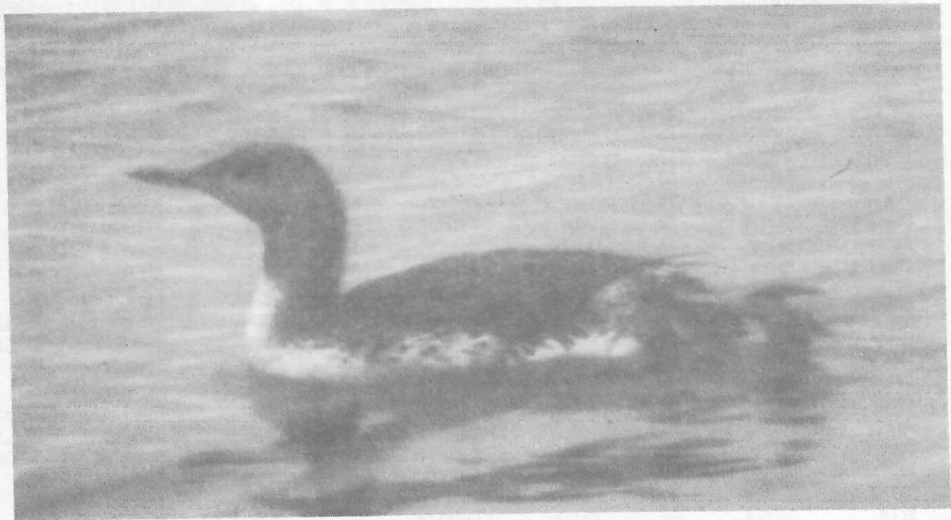
Red-throated loon (same individual as cover), 30 November 1988, Headlands Beach State Park.