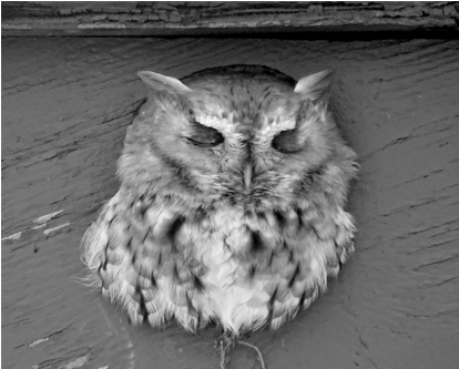
Su Snyder photographed this Eastern Screech-Owl taking a nap near Mt. Eaton, Wayne , on 18 Jan.

Three were sighted in each of six locations. (44 counties)