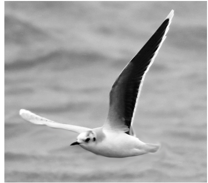
On 27 Nov, a Little Gull flashed one of those dark underwings for Debbie Parker at Lorain Harbor.

One spent from 13 to 24 Dec at Caesar Creek and (presumably) another was at Buck Creek between 10 and 14 Feb (both m. obs.).