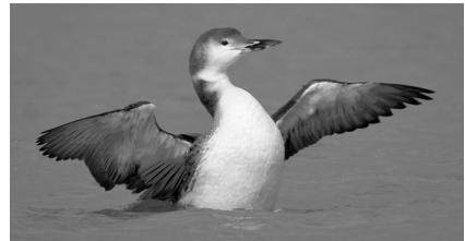
A Common Loon stretches its wings near Kelleys Island on 04 Nov when Tyler McClain was ready to capture the moment.

Sightings were more or less continuous except for a two-week gap in Jan. Birders found between seven and 10 at Lorain (city) harbor on 02 Dec. The inland high count was four, at LaDue between 01 and 05 Dec (m. obs.). (26 counties)