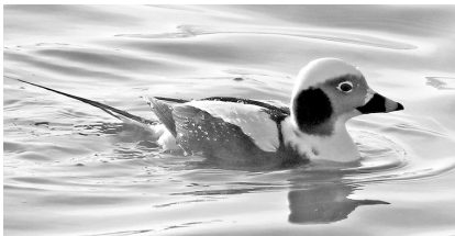
A striking male Long-tailed Duck put on a show at Miller Road Park, Lorain , for Debbie Parker on 01 Feb.

Counts of five came from Turkeyfoot Lake, Summit , between 07 and 10 Dec (m. obs.) and Miller Road Park, Lorain , on 02 Feb (Chris Pierce). (25 counties)