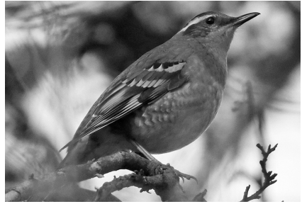
Debbie Parker captured this beautiful photograph of the Varied Thrush that visited Lake View Cemetery, Cuyahoga , on 04 Jan.