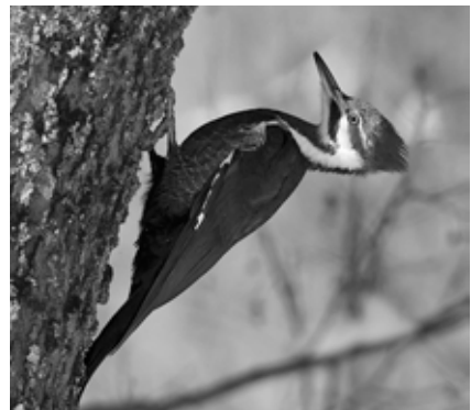
A hike in the woods after trees are bare of leaves can provide stunning winter views of Pileated Woodpeckers. Allan Clayton captured this image on 30 Dec 2012 at Cowan Lake, Clinton .

A hybrid of uncertain parentage was near Pipe Creek WA, Erie , between 09 and 16 Dec. The OBRC has photographs and testimony.