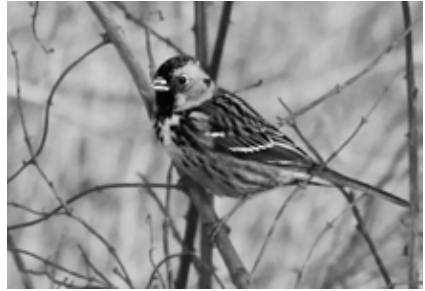
This wayward Harris's Sparrow was a life bird for many enthusiastic new birders during its several months of viewing opportunities at the Pickerington Ponds feeders.