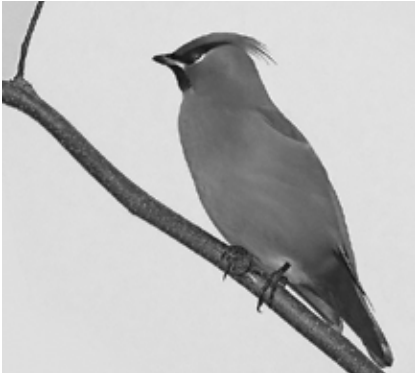
The parking lot at Maumee Bay SP was unusually busy on 02 Dec 2012, filled as it was with enthusiastic birders sporting spotting scopes, binoculars, and large lenses all focused on a flock of Bohemian Waxwings.

central and southern counties. The species was statewide, however: 71 counties had sightings.