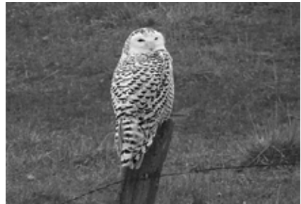
This juvenile Snowy Owl was northeast of Berlin, Holmes, on 17 Dec 2012.