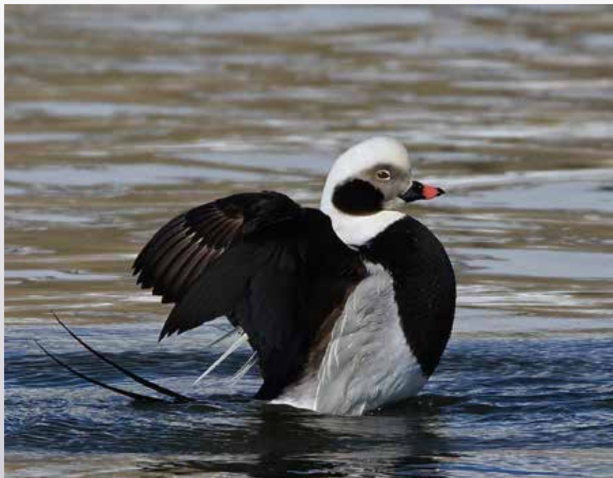
showcased this stunning Long-tailed Duck on 13 Feb at Deer Creek SP, Pickaway.