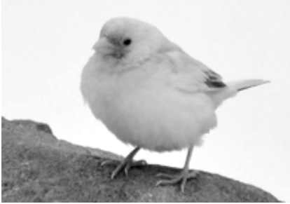
This enigmatic bird at an I-70 rest area in Licking needed further inspection to determine it was a leucistic House Sparrow, photographed on 03 Feb.

The farms along Deerfield Avenue, Stark , site of so many large blackbird flocks, also hosted 400 House Sparrows on 03 Feb (Jacob Roalef). About 80 counties had sightings.