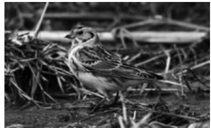
A common but always gratifying winter visitor of rural Ohio, this Lapland Longspur was on 21 Feb by Washburn Road in Marion.