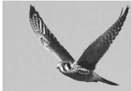
This American Kestrel found the Lorain Impoundment to have abundant hunting grounds and was impressively captured in this photo by Tom Fishburn on 28 Dec.

Killdeer produced 15 for Ron Sempier on 05 Dec. Kent Miller's CBC route in Holmes turned up 12 on 20 Dec. At least 80 counties provided reports.