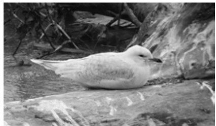
An accidental visitor to central Ohio and cause for enthusiasm for winter birders, this "Kumlein's" Iceland Gull was on 23 Feb on the Scioto River in Franklin.

Indeterminate birds were reported in Cuyahoga , Franklin , and Hancock .