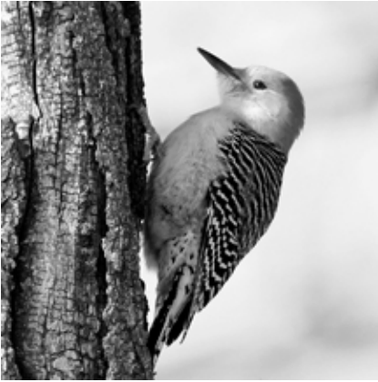
Red-bellied Woodpeckers add a noisy yet familiar spirit to the barren winter landscape. on 15 Feb at Coe Lake, Cuyahoga.