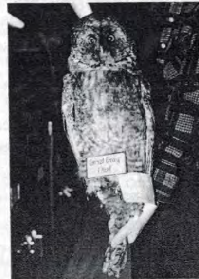
Great Gray Owl specimen, OSUM #16625