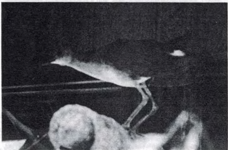
Purple Gallinule. Found in Cleveland, Sept. 24, 1992. Photo taken at Lake County Metroparks Wildlife Rehabilitation Center, Nov. 24, 1992. [Currently under review by the Ohio Bird Records Committee].

For a total of 137 hours on 35 days between August 11 and November 8, 1992, I banded birds at Lakeshore Metropark (Lake Co.). My final tally was 2597 individuals banded, representing 84 species. My top numbers were as follows: White-throated Sparrow-- 631; House Finch-- 317; Golden-crowned Kinglet-- 197; Dark-eyed Junco-- 143; Song Sparrow-- 120; Ruby-crowned Kinglet-- 118; Yellow-rumped Warbler-- 102; White-crowned Sparrow-- 102; Swainson's Thrush-- 89; Hermit Thrush-- 88; Am. Goldfinch-- 66; Gray Catbird-- 64; N. Cardinal-- 41; Mourning Dove-- 40; Swamp Sparrow-- 31; Brown Creeper-- 30; Winter Wren-- 30; Lincoln's Sparrow-- 25; Gray-cheeked Thrush-- 23; and Blue Jay-- 22. Other interesting birds banded include a Marsh Wren and a Dickcissel on October 17, as well as 3 Orange-crowned Warblers, 7 Connecticut Warblers, and 8 Mourning Warblers for the season. By John Pogacnik, 4765 Lockwood Rd., Perry, OH 44081.