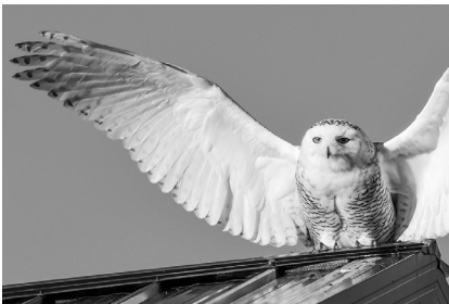
An incredible Snowy Owl stretched its wings while Mandy Roberts was quietly watching along State Route 81 in Hardin on 09 Feb.