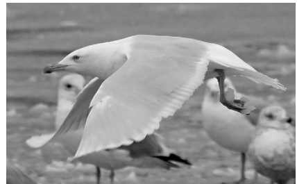
a beautiful Glaucous Gull, one of the United States' largest gulls, at the Columbus Road Lift Bridge in Cleveland on 07 Feb.