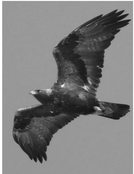
Debbie Parker captured this fantastic image of a majestic Golden Eagle flying over The Wilds on 20 Jan.