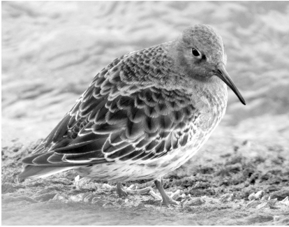
Charanya Ganesh was lucky enough to photograph this stunning Purple Sandpiper at Headlands on 20 Dec.

Lots of birders saw one at Headlands between 20 and 23 Dec. It or another was at Wendy Park on 31 Dec (Todd Eiben).