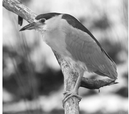
at Cleveland's Scranton Flats on 08 Feb.