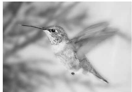
An incredible Rufous Hummingbird spent a few months at a home in Hamilton Township, Warren.

* Still present as of this writing in early Apr.