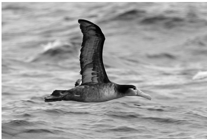
This Short-tailed Albatross enhanced the boat trip to Attu on 17 May.

These unique pelagic waters served to add several birds to my life list: Fork-tailed Storm-Petrel,