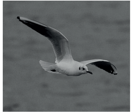
Black-headed Gull. Jen Brumfield discovered one crowd-pleasing individual at Lorain harbor, Lorain, on 27 Nov 2010; it remained until 05 Dec.

Jen Brumfield discovered one crowd-pleasing individual at Lorain harbor on 27 Nov; it remained until 05 Dec.