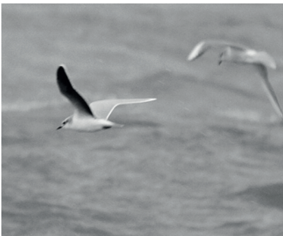
Little Gull. Laura Keene teased this bird out of a large flock of Bonaparte's gulls at Lorain harbor, Lorain , on 06 Dec 2010.

These were reported from a total of 10 sites in Clermont (1 site), Cuyahoga (5), Erie (1), Lake (2) and Lorain (1). Participants on the 11 Dec BSBO cruise from Cleveland found two; all other reports were of one. The Clermont bird was on the Ohio River shore at New Richmond.