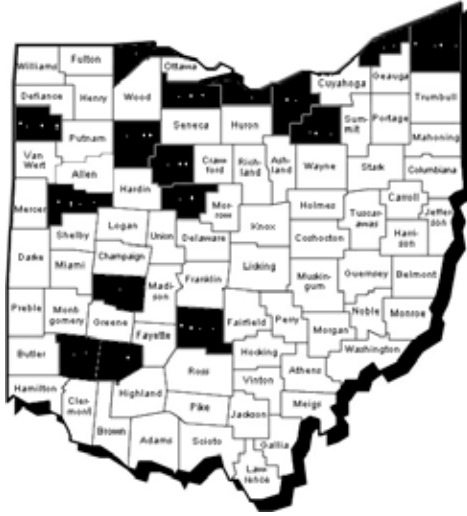
Franklin's Gull, Nov. 1988 distribution