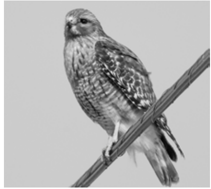
This Red-shouldered Hawk was photographed on 07 Feb at East Fork.

A four-person CBC team found nine in their 30 miles of travel in Brown on 02 Jan. (72 counties)