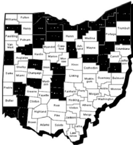
Franklin's Gull, Nov. 2015 distribution