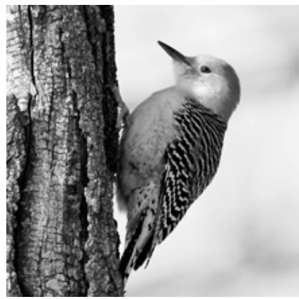
Red-bellied Woodpeckers add a noisy yet familiar spirit to the barren winter landscape. on 15 Feb at Coe Lake, Cuyahoga.