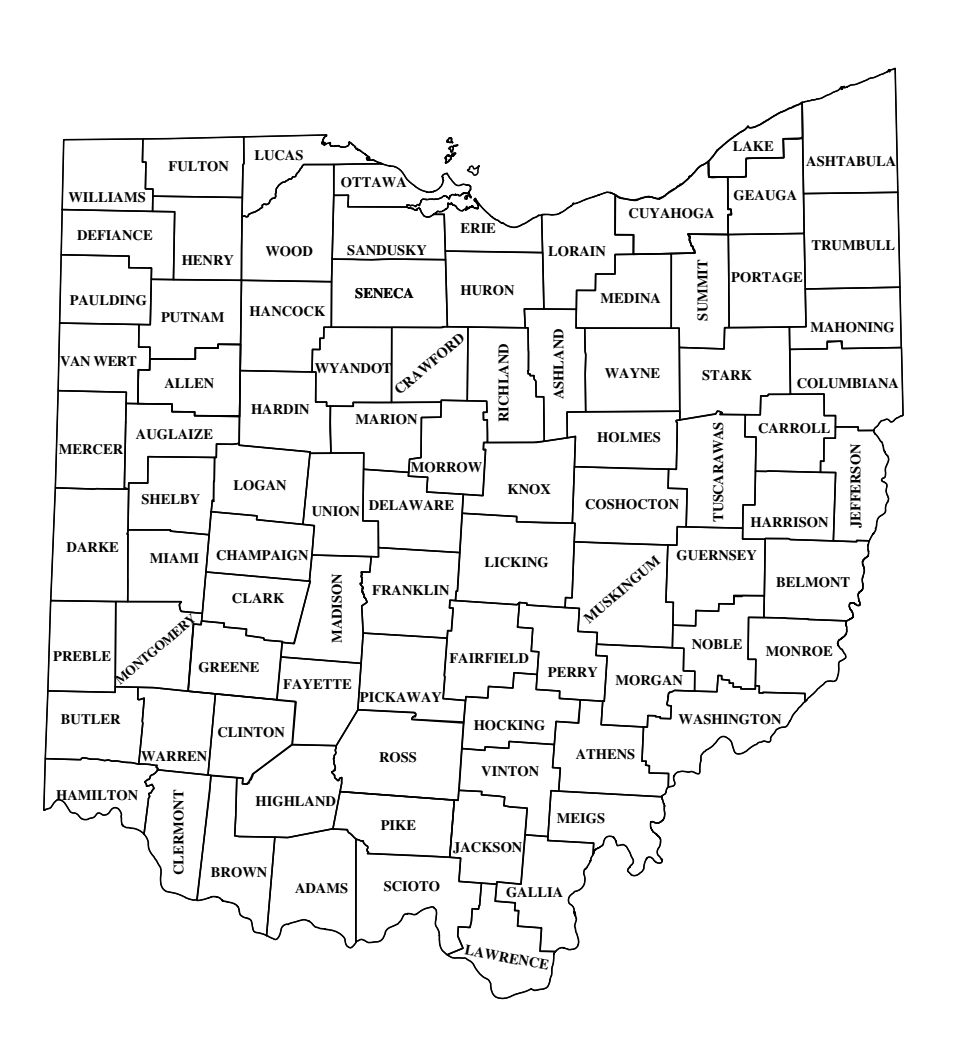
The Counties of Ohio